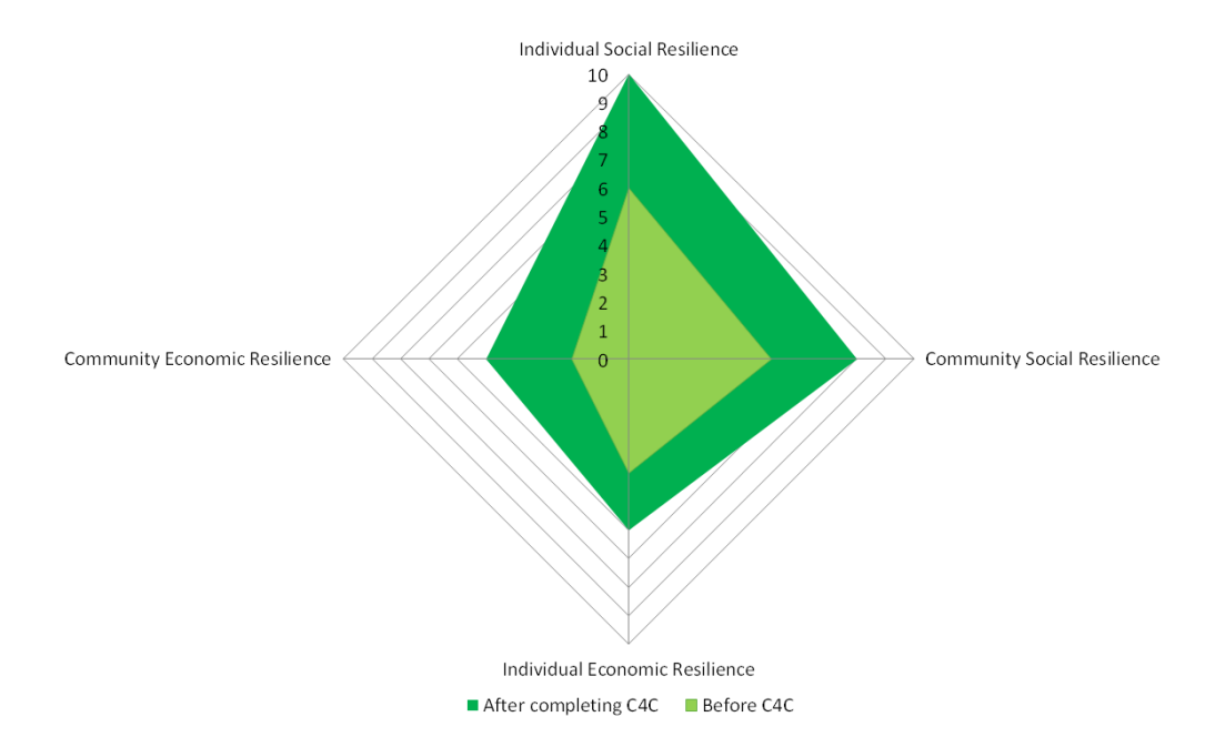
Figure 2. Simulation of how we might represent the assessment of four aspects of 'change'

This approach will be applied in the C4C monitoring and evaluation. We aim to identify how effective the overall C4C intervention is in terms of building community resilience and measure the difference C4C makes within the participating communities. In addition, the research process should enable us to establish a methodological and conceptual framework that will underpin the monitoring and evaluation of other similar C4C-type interventions.